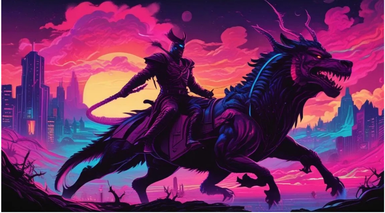
Antichrist Demanding Worship